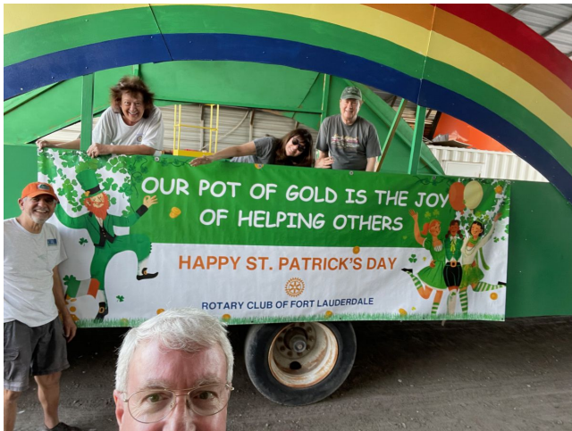
Friday - Working on the finishing touches.