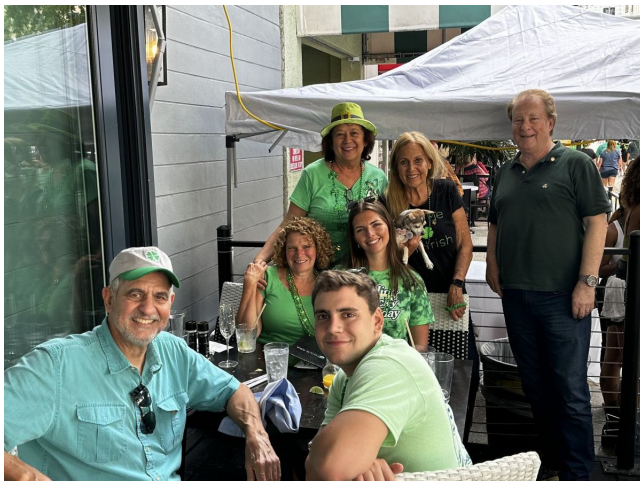
Post parade lunch at the Riverside